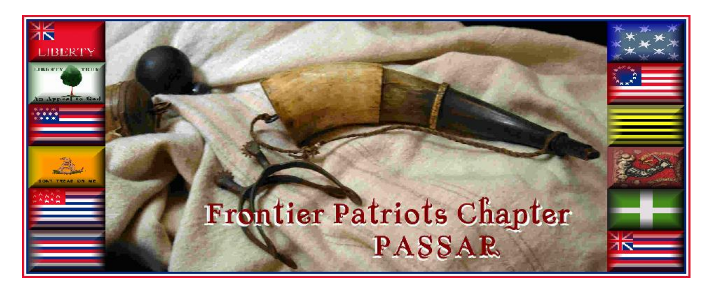
This is NewsLetter Issue No. One ~ For the year 2014